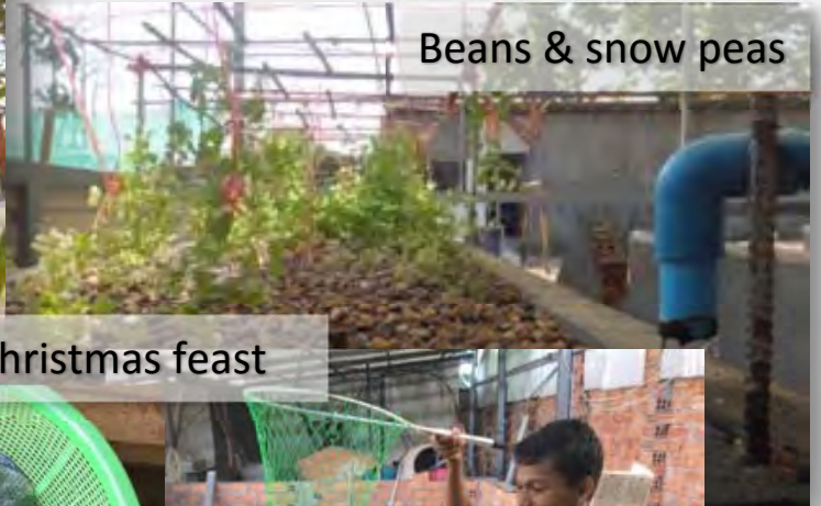
Home grown Christmas feast