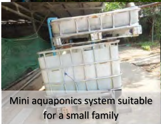
Mini aquaponics system suitable for a small family