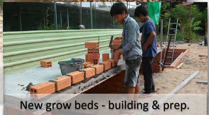
New grow beds - building & prep.

Please consider helping this vital project which is still in need of more financial support.